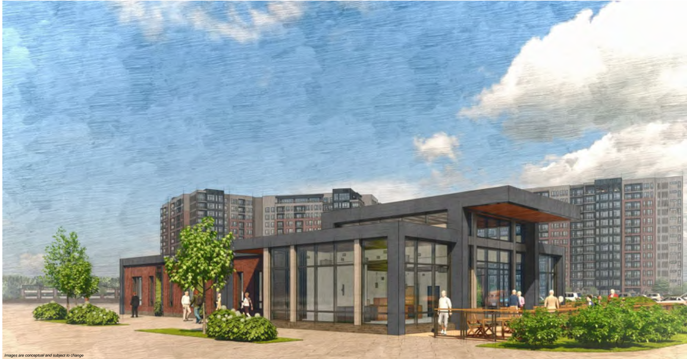
Images are conceptual and subject to change