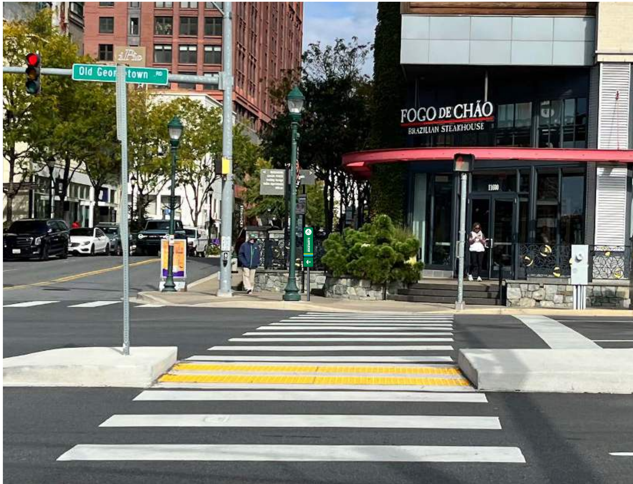
Sign shown in location for reference only and may not represent actual scale and proportions.