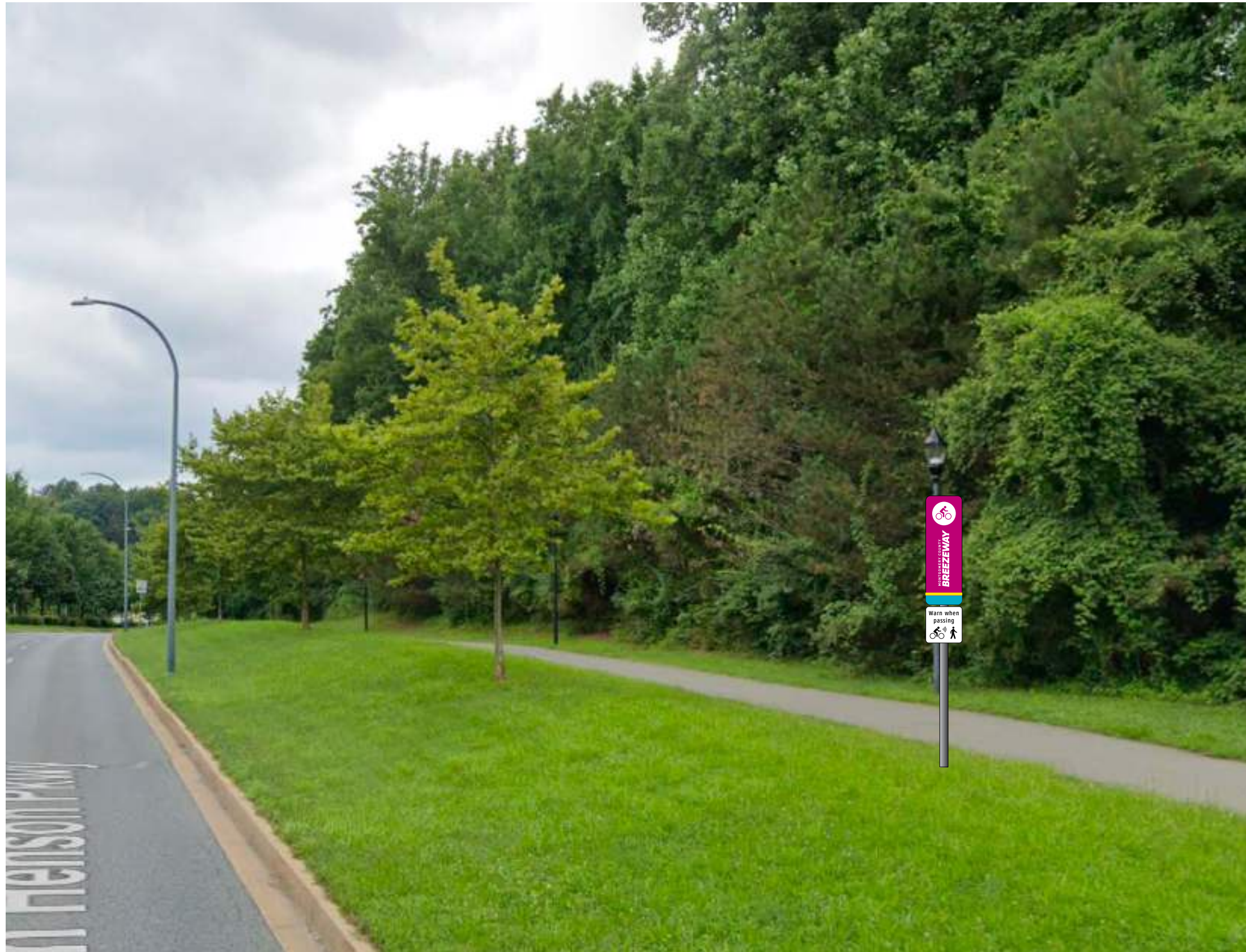
Sign shown in location for reference only and may not represent actual scale and proportions.