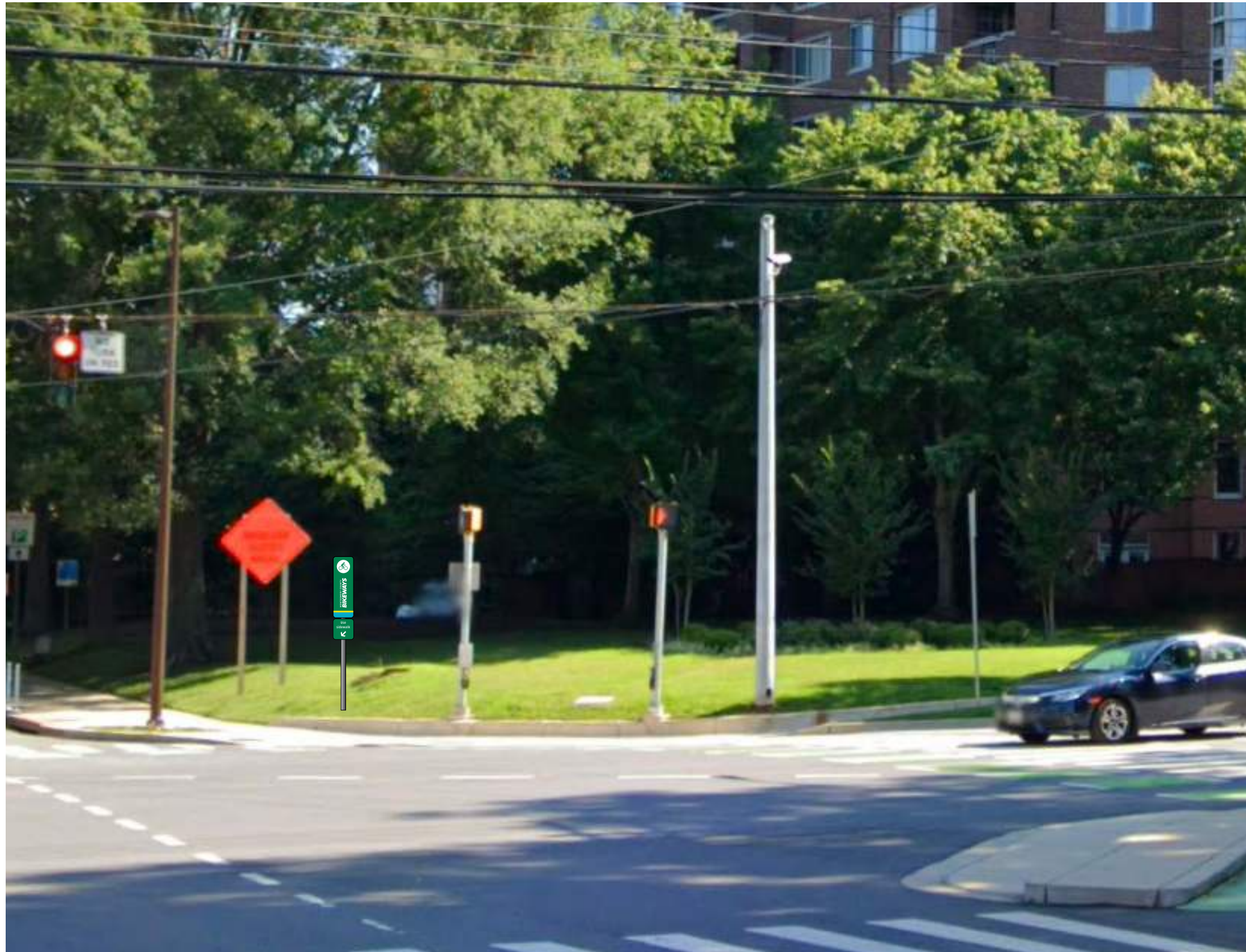
Sign shown in location for reference only and may not represent actual scale and proportions.