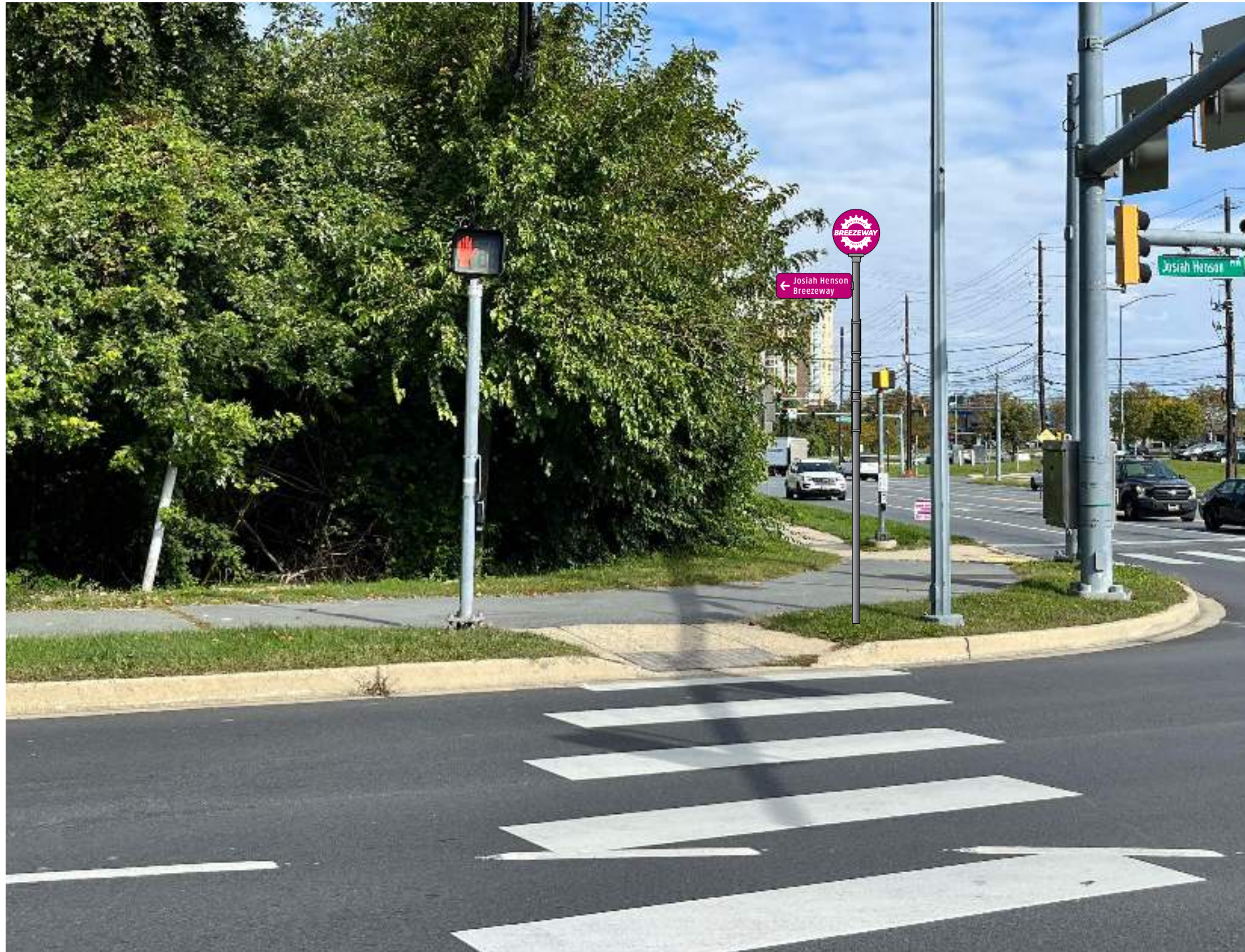
Sign shown in location for reference only and may not represent actual scale and proportions.