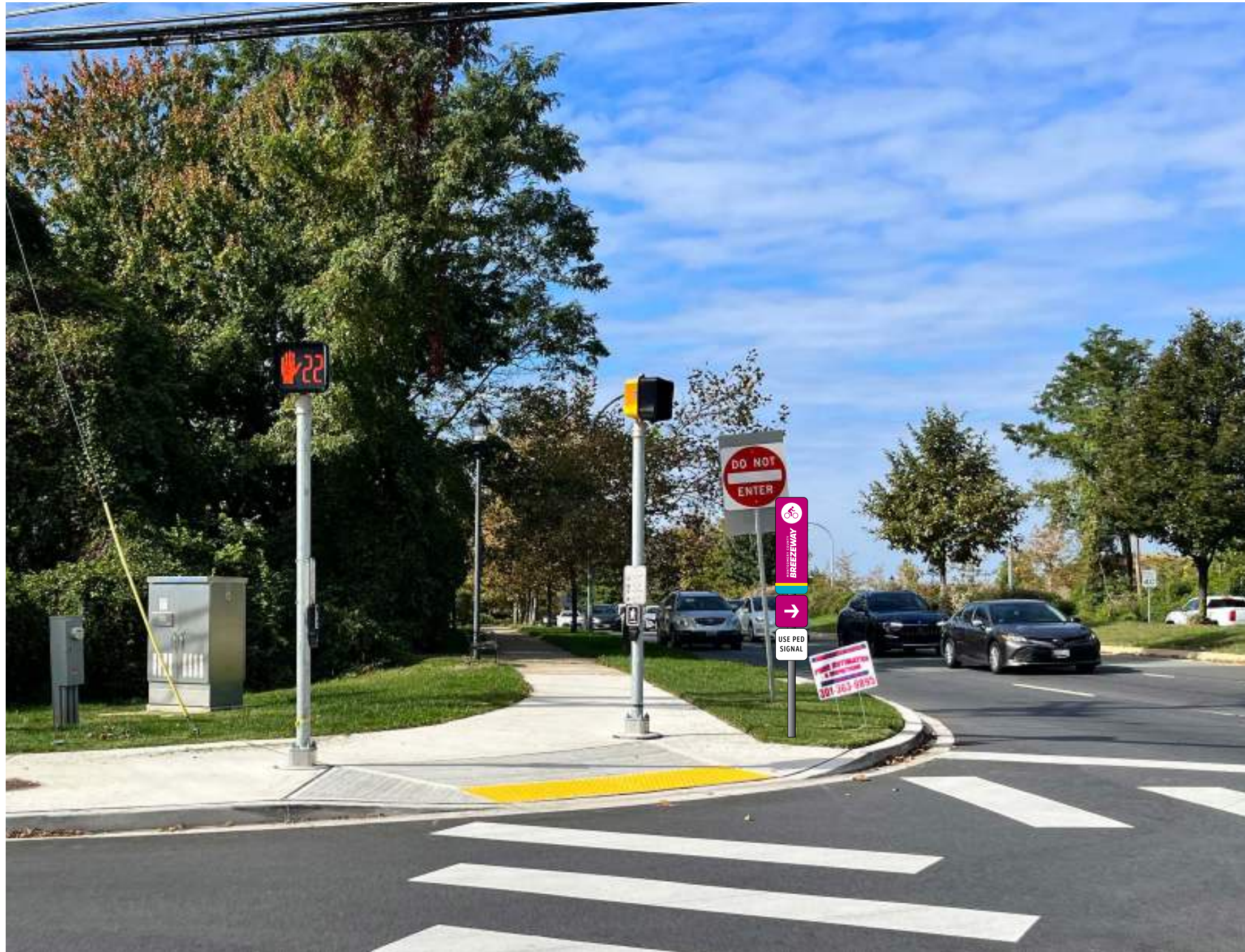
Sign shown in location for reference only and may not represent actual scale and proportions.