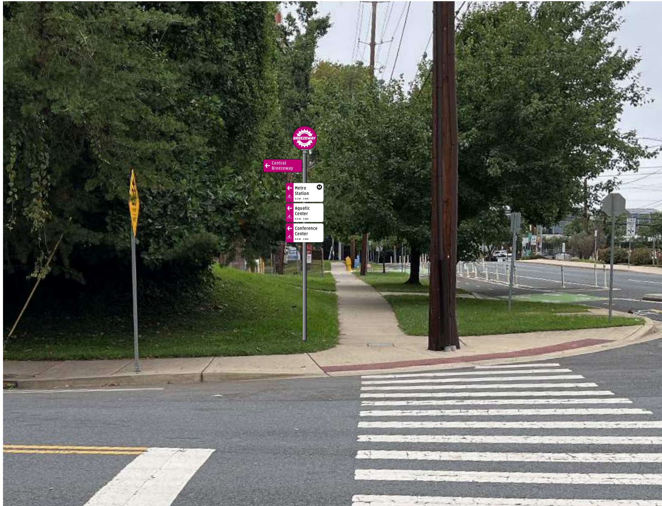
Sign shown in location for reference only and may not represent actual scale and proportions.