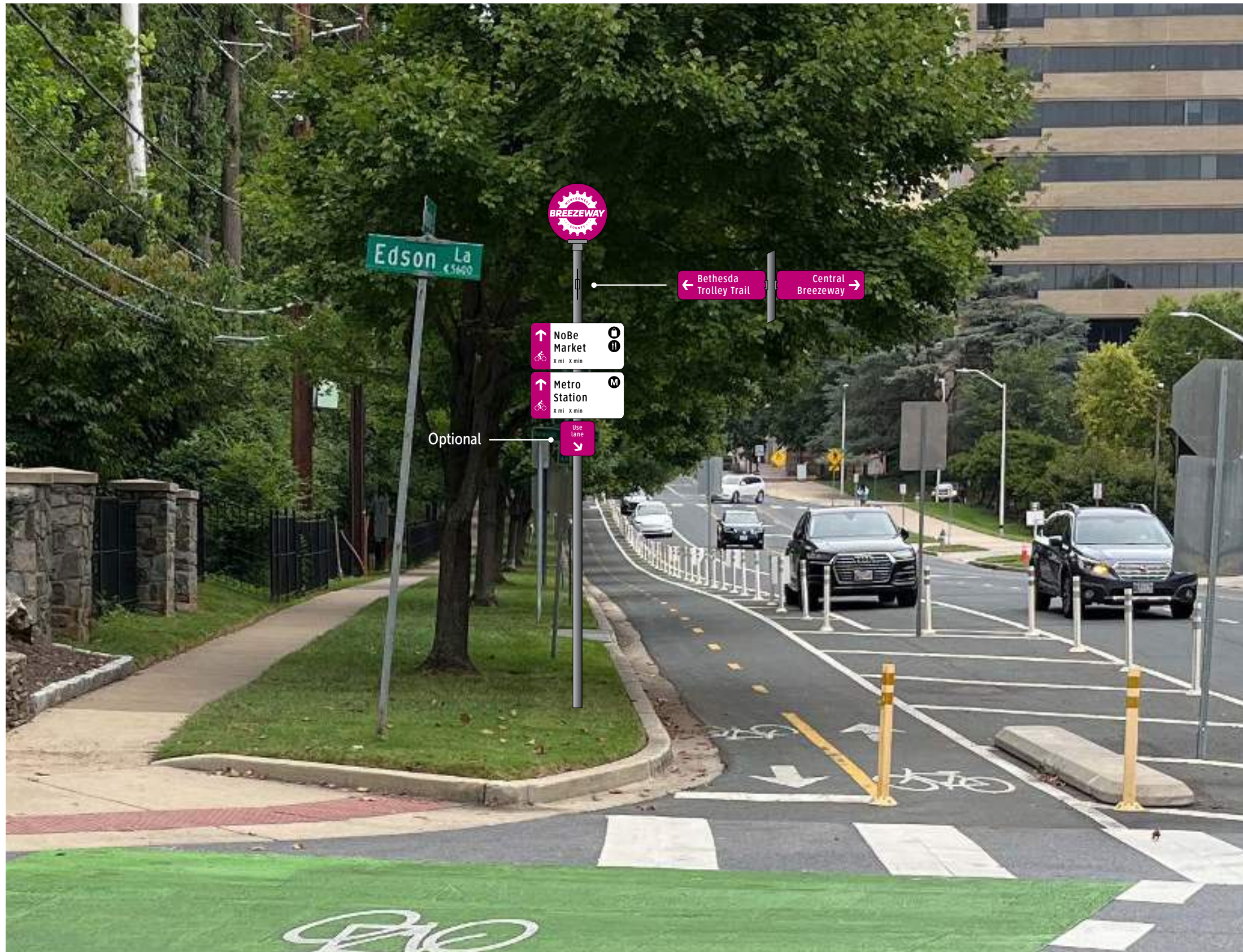
Sign shown in location for reference only and may not represent actual scale and proportions.