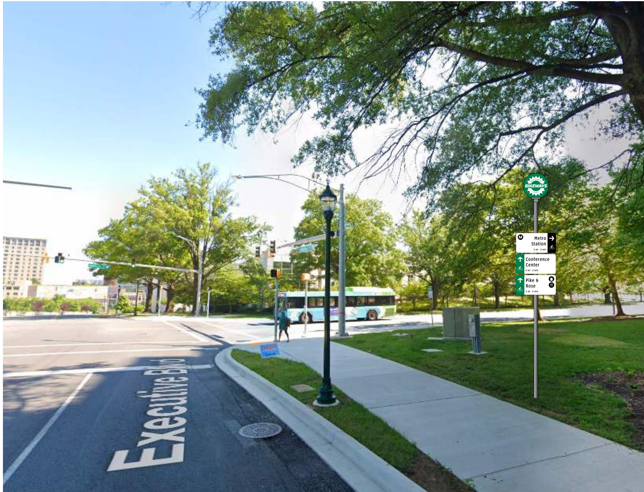
Sign shown in location for reference only and may not represent actual scale and proportions.