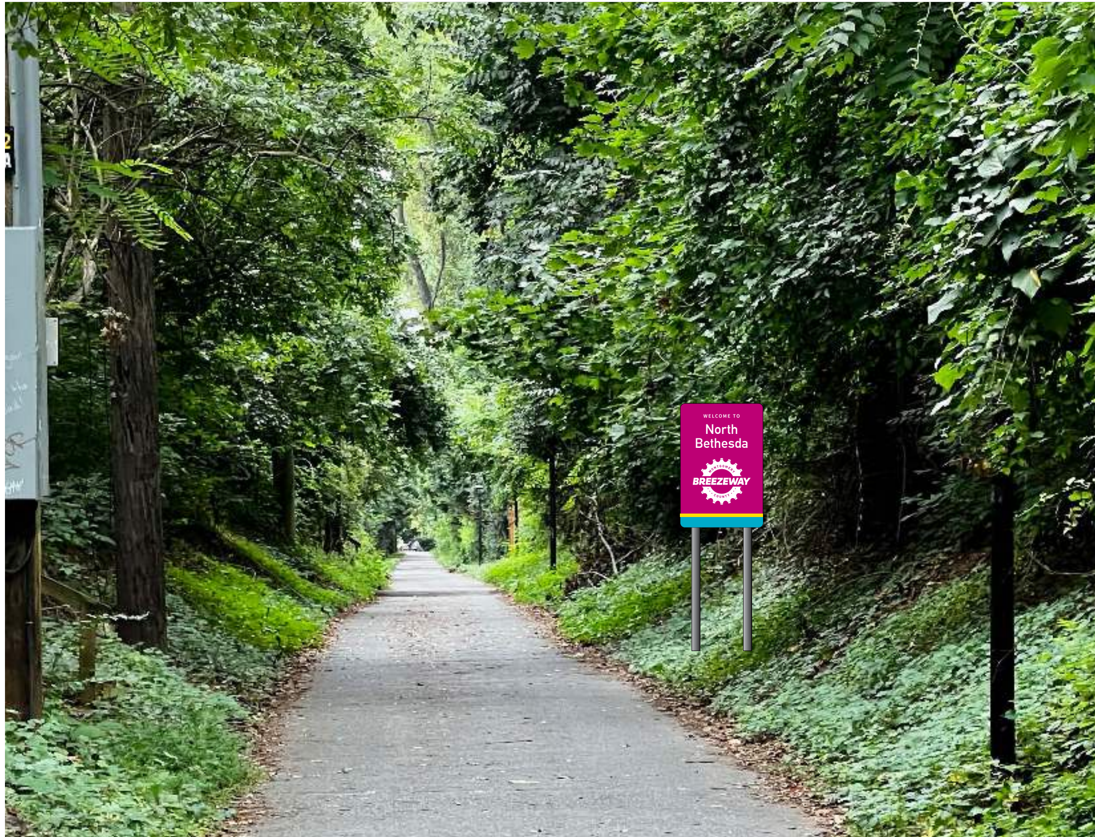
Sign shown in location for reference only and may not represent actual scale and proportions.