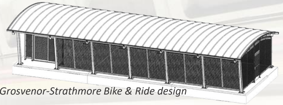
Grosvenor-Strathmore Bike & Ride design