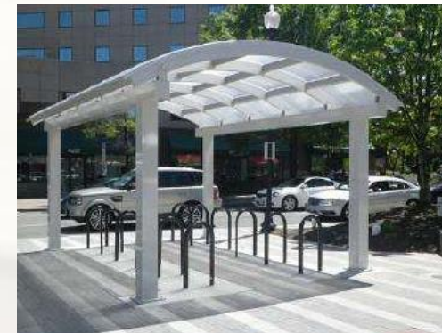
Example of covered bike racks