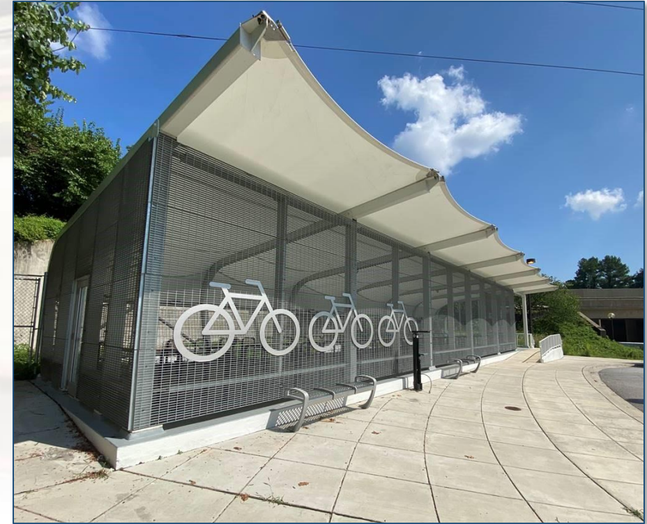
Bike & Ride at East Falls Church metro station